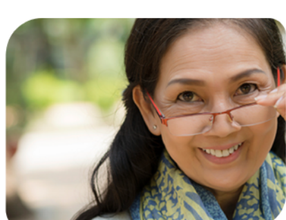
Hearing Aid Benefits